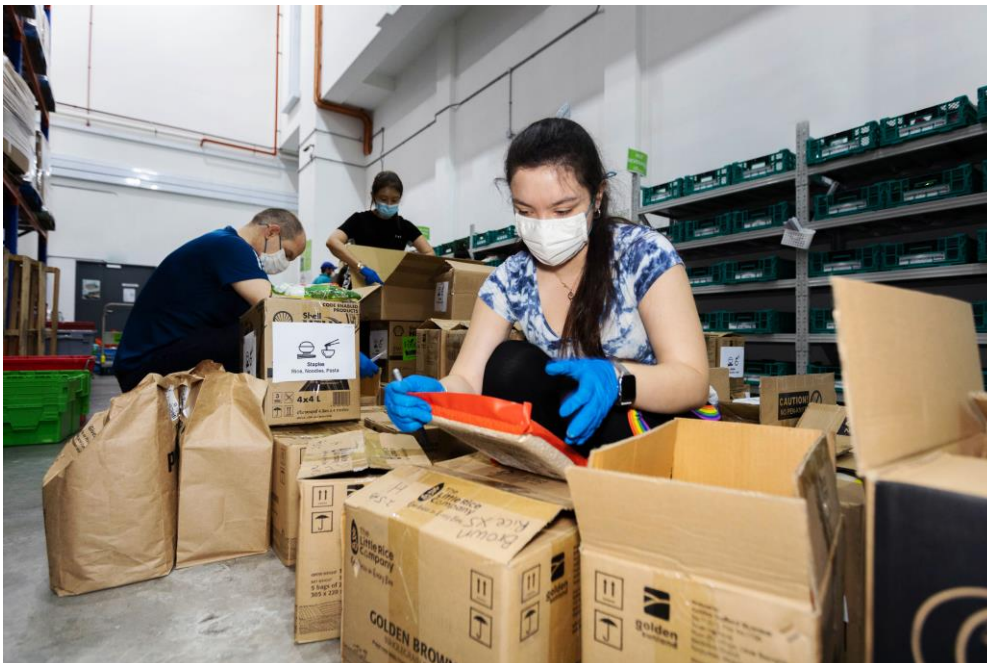
Sorting donations for storage and distribution.

From October 16 to 18, about 360 cars from 18 car clubs collected, donated and delivered food items that will go to 360 beneficiary organisations that feed more than 300,000 individuals across Singapore. Members of the public also donated by dropping food items in Bank Boxes around the island, which were picked up by volunteers and sent to FBSG's warehouse.