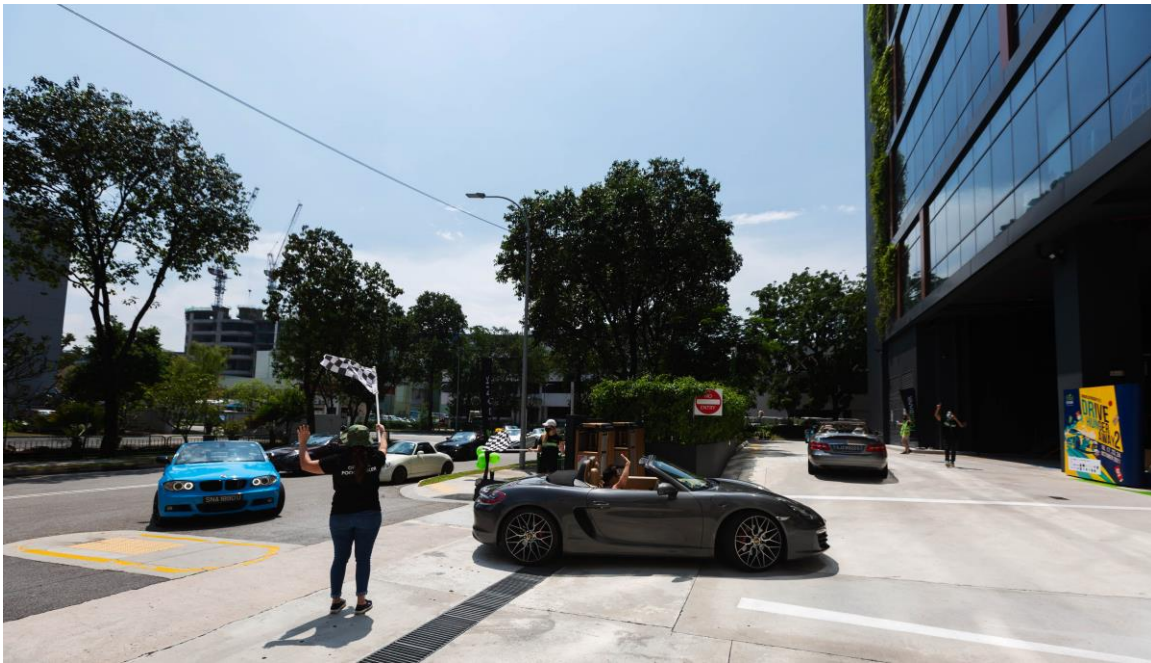
Drivers sending their donations to The Food Bank Singapore

20 car clubs chip in to donate and deliver food to people in need