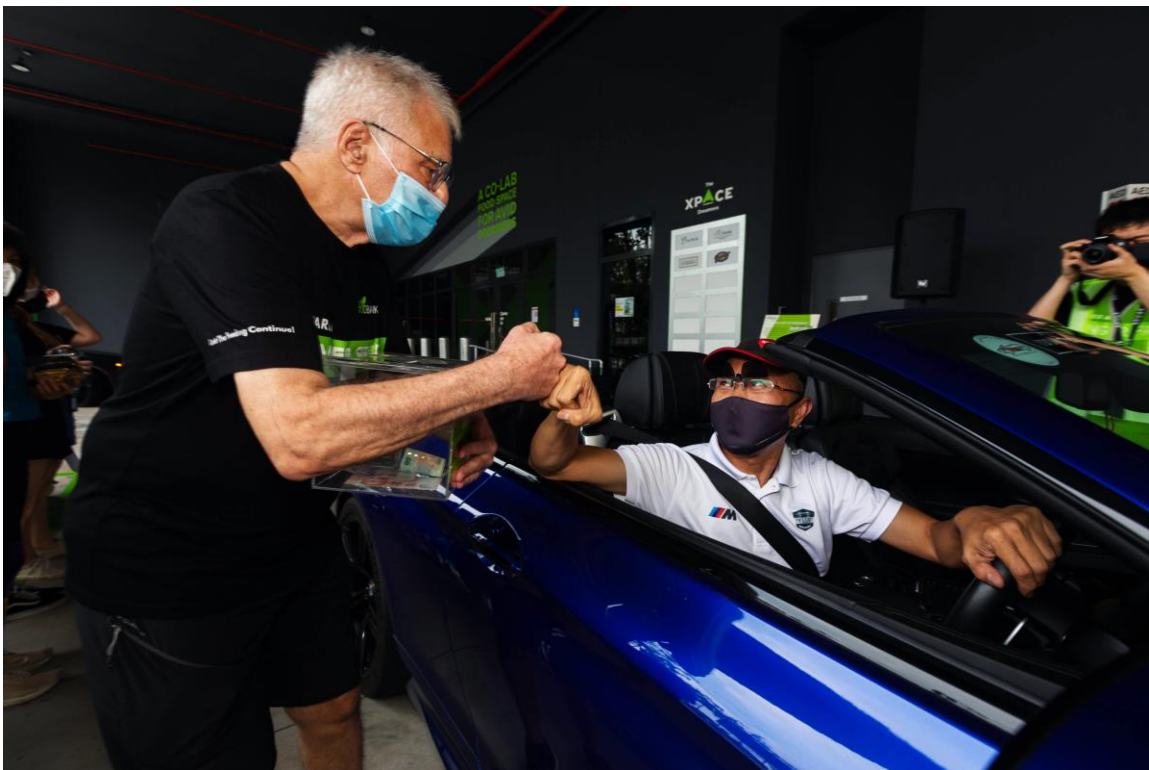
Fist-bumping in appreciation of the effort.