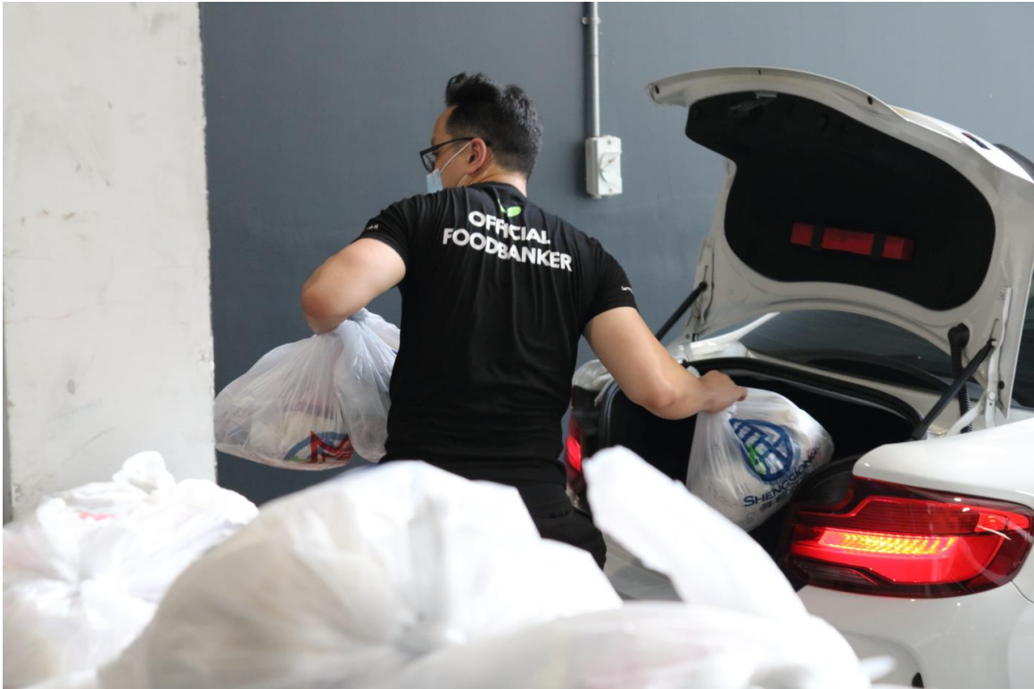
Unloading the donated food over two weekends.