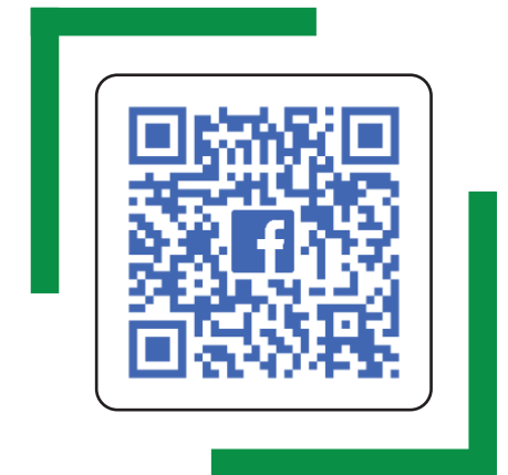
President Halimah Yacob's Facebook