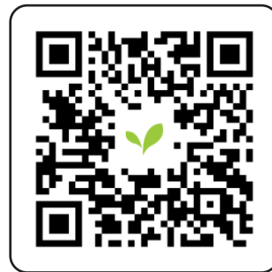
Check Out Our Web App Here