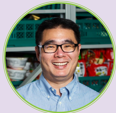
Wong Hsien Loong