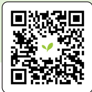
Learn more about our Hunger Report here